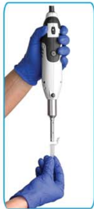
Ergonomic, "Slim-line" handle design