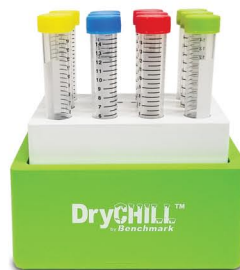
Item: DC1215 12 x 15 ml tubes (16-17mm)