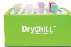
Item: DC4020 40 x 1.5/2.0 ml tubes