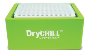
Item: DC9602 96 x 0.2 ml tubes or 1 x PCR plate