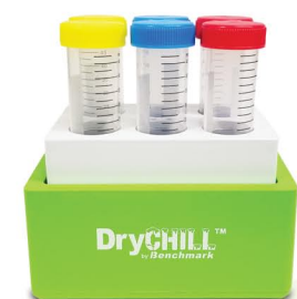
Item: DC0650 6 x 50 ml tubes (29mm)

The DryChill cooling blocks are designed to store samples safely on the lab-bench without sample degradation due to temperature increase or fluctuation. Unlike traditional ice buckets, these blocks do not require any ice and are uniquely designed to minimize condensation, resulting in a convenient, mess-free cooling.