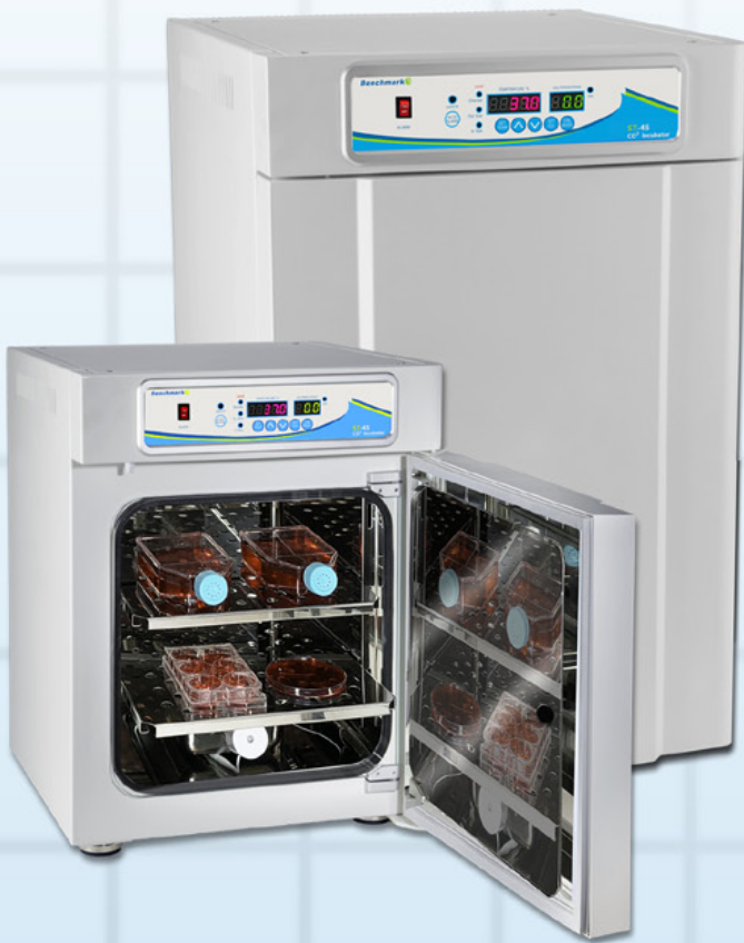
ST Series (ST-45 and ST-180)